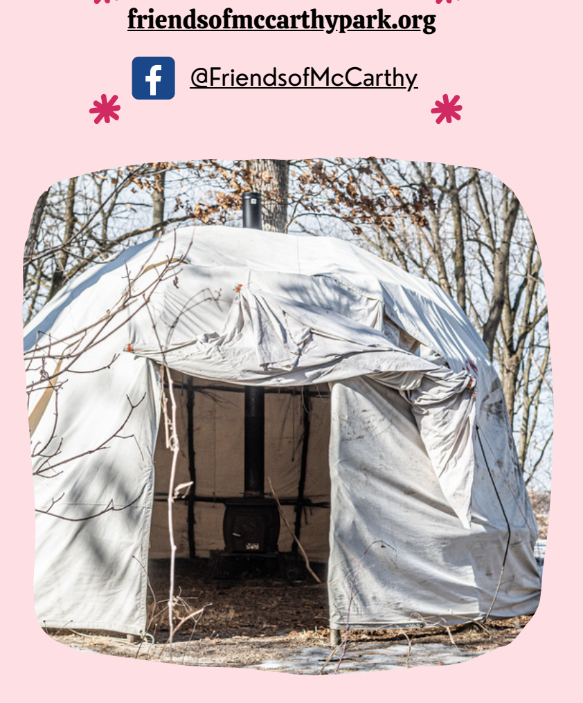
The ciporoke up by the group camp at MYCCP